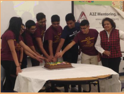
Class of 2018